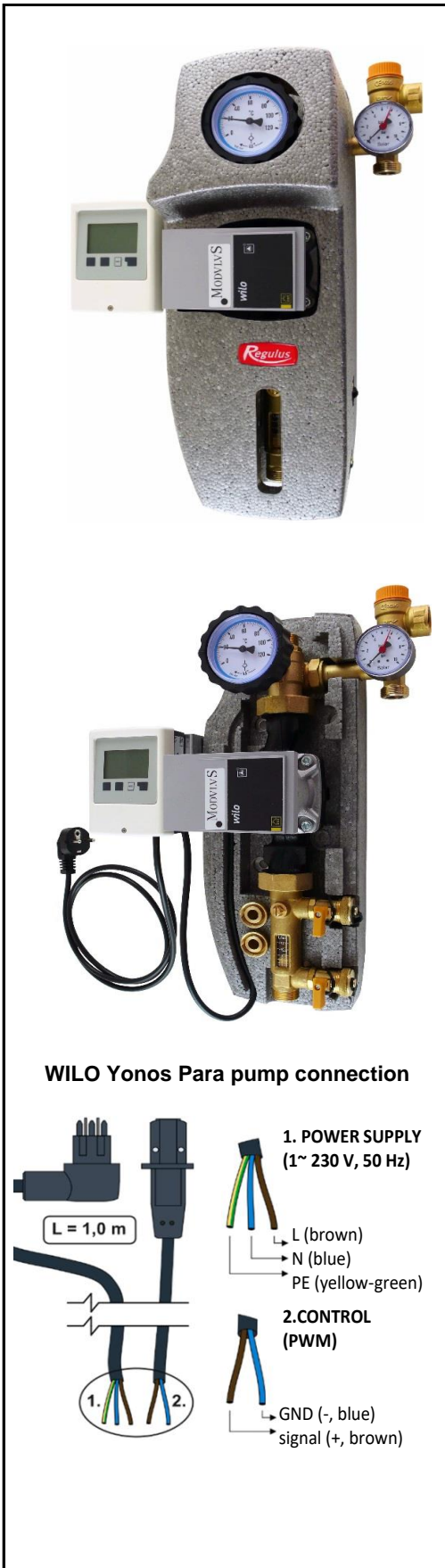
WILO Yonos Para pump connection