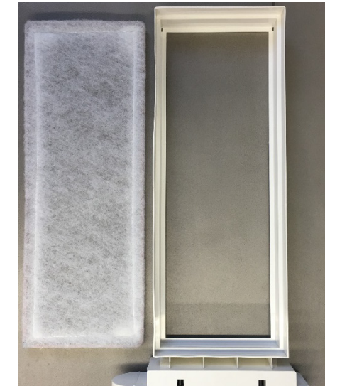
Set of F5 pollen filters (shall be shifted into the openings)