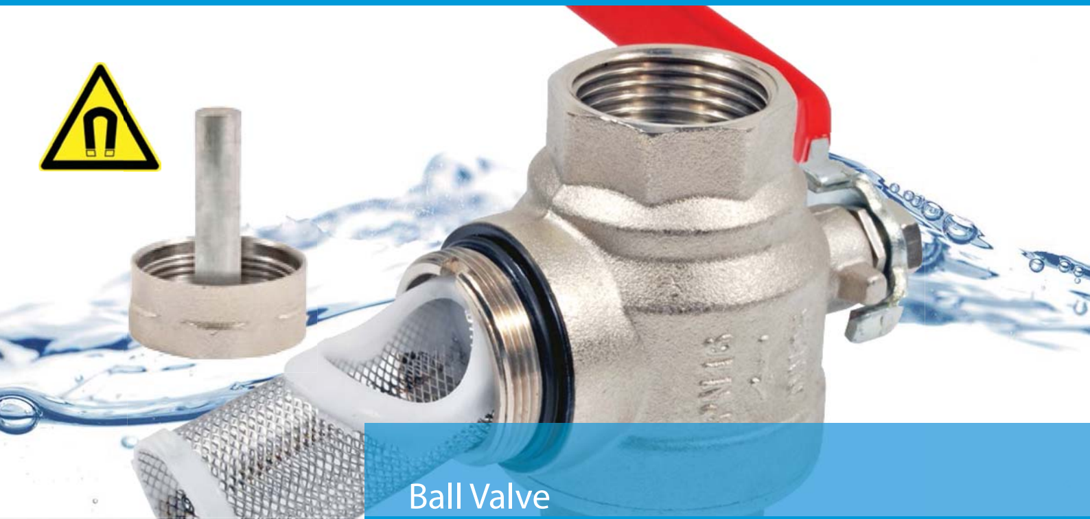
Ball Valve with strainer & magnet