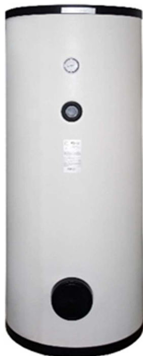
RBC 500 HP