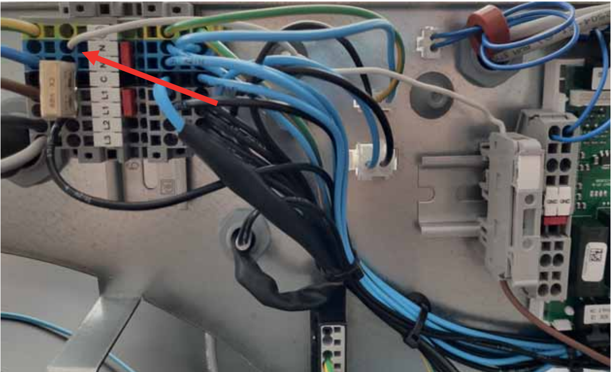
Fig. 1b – Heating cable wiring to the terminal board – CTC 600 series heat pump