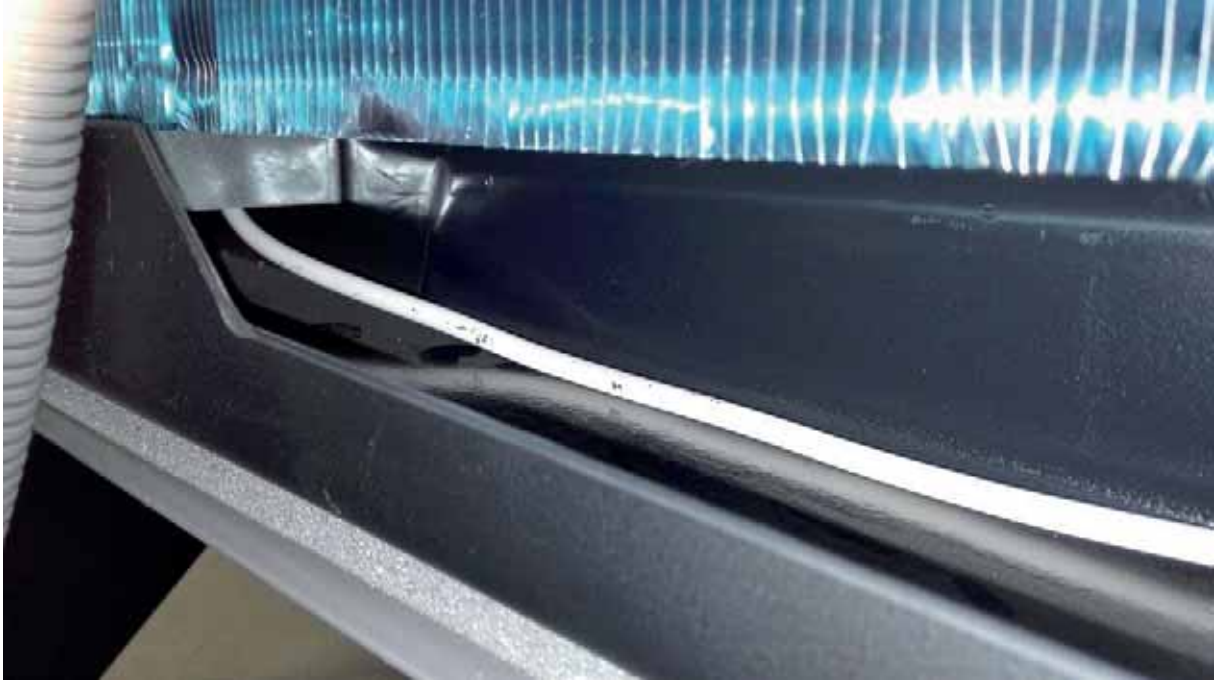
Fig. 2 – Running the heating cable through the condensate tray