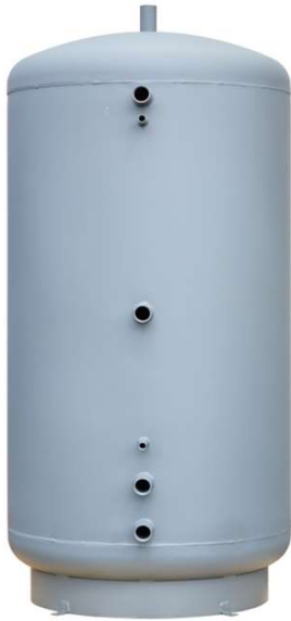
PS 1250 E+ with insulation