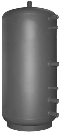
PS 750 E+ with insulation