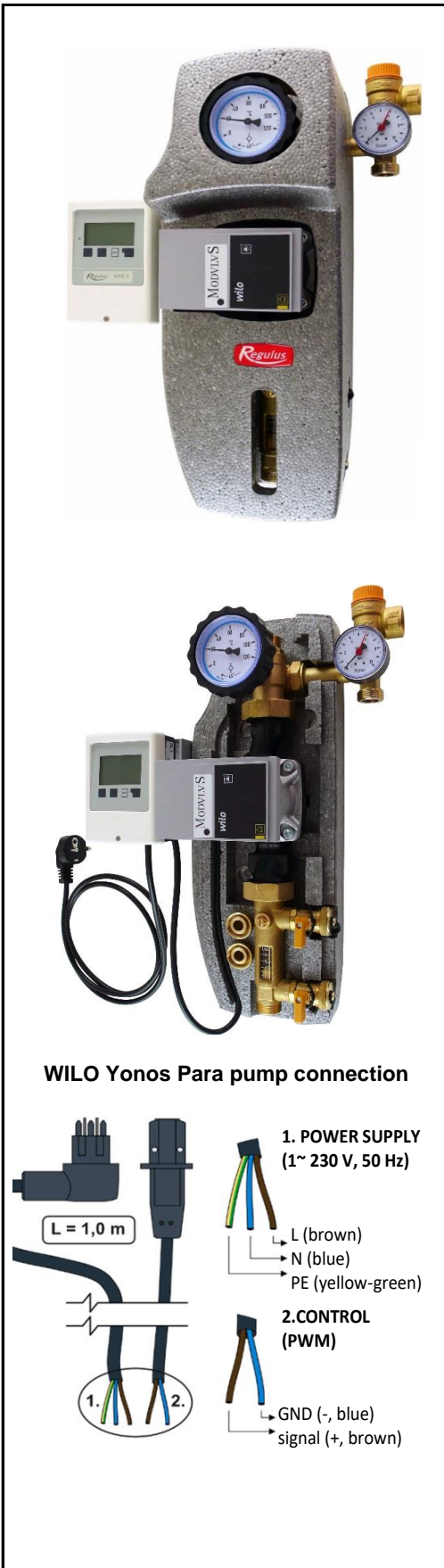
WILO Yonos Para pump connection